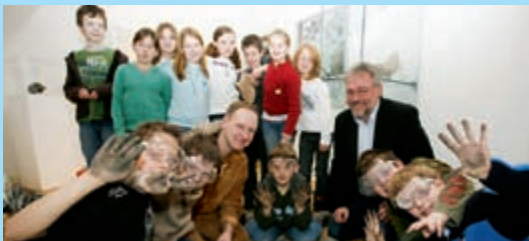
The show called “Ice-Age Week” organised by RWE TSO Strom is now available to schools.

It goes without saying that you can get involved by letter or by fax as well. Simply print out and return the application form available on the Internet or request a copy by calling the RWE COMPANIUS hotline.