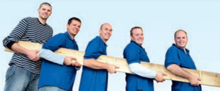
A formidable team – RWE Supply & Trading giving the outdoor play area of the Vincenzheim in Dortmund a facelift.