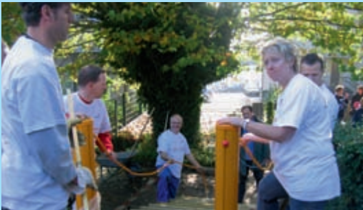
RWE Rhein-Ruhr installed two new see-saws and a small climbing frame at the St. Marien nursery school in Essen.

The project proposals we receive from outside the company all require a project supervisor. We then take it upon ourselves to find an employee within the RWE Group who is willing to support the project in the capacity of supervisor. What this means for you in practice is an opportunity to put your community involvement on a broader footing.