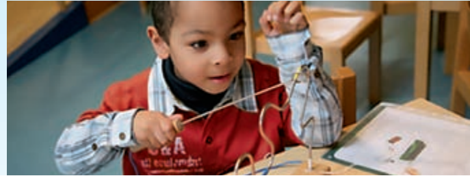
Learning about electricity can be lots of fun!

The RWE Group takes its responsibilities as a leading energy supplier very seriously indeed. But it is our employees who make us a visible and active part of the communities and regions in which we operate. And because we can achieve so much more by working together, we want to encourage you to become involved in what has become a matter close to our hearts.