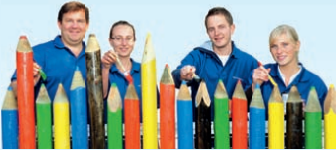
Employees from RWE Supply & Trading in Germany and the UK helping out at the Vincenzheim in Dortmund.