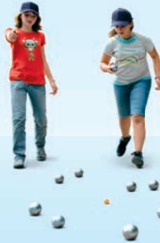
Employees of RWE Westfalen-Weser-Ems and RWE Rhein-Ruhr organised a boules tournament for children with and without disabilities.