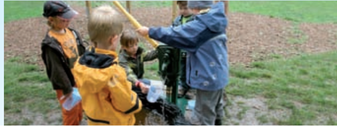
Thanks to enviaM, the Montessori Children's House in Cottbus now has a water-and-sand play area in which children can experiment with natural materials.