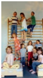
What sweet dreams the little ones will now have with all those fluffy clouds sailing across their walls!